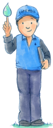
The healthy well water folks!